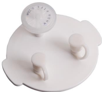
(a) PP funnel lid