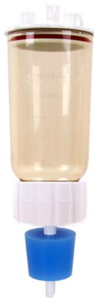
(b) Applied in LF 3