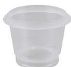
Millipore, 100 ml / 250 ml Microfil® disposable plastic funnel (MIHAWG100 / MIHAWG250)