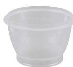
Pall, 100 ml / 250 ml Sentino® disposable plastic funnel (4870 / 4871)