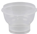
Sartorius, 100 ml / 250 ml Microsart® disposable plastic funnel (16A07-10-----N/ 16A07-25-----N)

Step 2. Choose the disposable funnel and adaptor