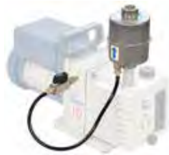
Exhaust Mist Eliminator shown installed on pump with oil return line.

Exhaust oil recyclers are recommended for vacuum systems with continuous pressure of 1 torr (1mm Hg) or higher. 1 At these pressures, conventional exhaust filters quickly saturate. The Mist Eliminator System continuously separates oil mist from the vacuum pump exhaust and actively returns the oil to the pump.