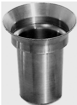
DYE BEAKER Stainless steel AISI 304. Volume: 500 ml. Part No. 6000291