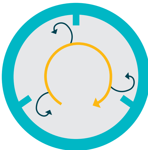
Effect of the baffles part (viewed from above)