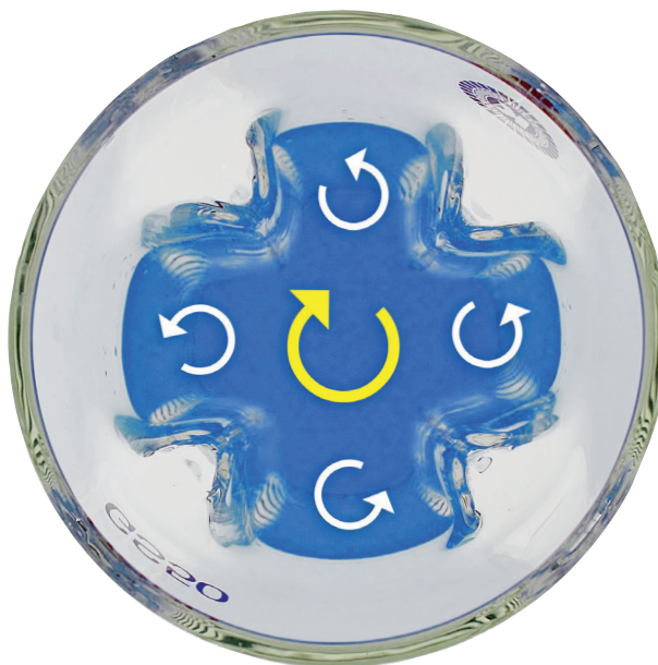
GS vessel principle (viewed from top)

Borosilicate glass is a chemical and temperature-resistant glass and shows an inert behaviour towards most of the chemicals. The sterilizable screw caps with PTFE or a silicone seal are temperature-resistant up to 180°C. The stainless steel 18/10, which the vessels are made of, is rustproof, durable, has good insulating properties, completely hygienic, not toxic and not magnetic.