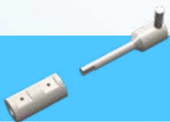
20 CS Ceramic