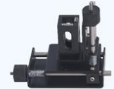
Micro Volume cell holder Measuring Samples below 500µl