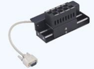
Automatic 8 cell holder Measure 8 Samples at once (Included with the product)